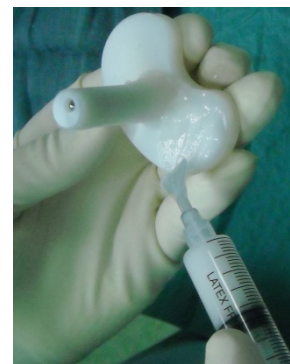
Figure 4. The hydrogel can be applied to modular parts, as shown here on the polyethylene tibial insert of a revision knee prosthesis, to provide a complete surface protection.