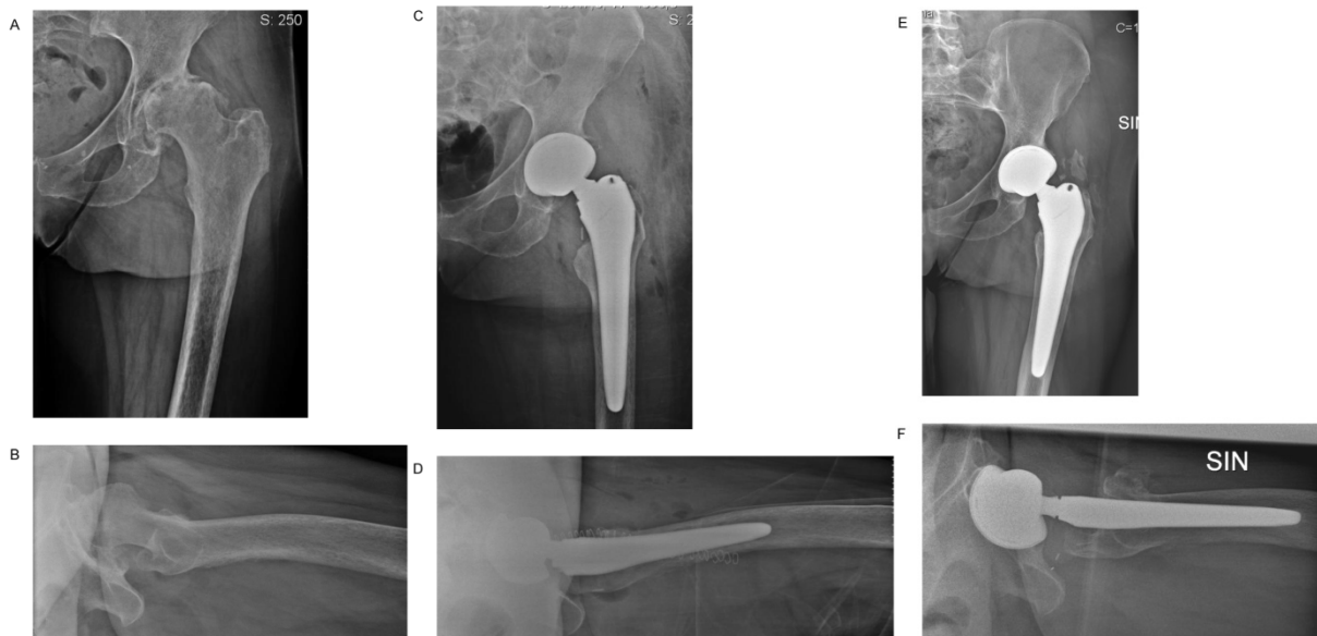
Figure 5. Female, 56 years old. Severe rheumatoid arthritis. Cementless total hip arthroplasty, coated with vancomycin 5% loaded DAC hydrogel. A and B. Pre-operative x-ray. Immediate (C and D) and (E and F) postoperative radiographic images at 18 months showing complete implant osteointegration at follow-up.

PJI denotes prosthetic joint infection; MRSA methicillin-resistant Staphylococcus aureus ; MSSE methicillin-sensitive Staphylococcus epidermidis ; MRSE methicillin-resistant Staphylococcus epidermidis ; BMI body-weight index (weight in kg divided by height in meters squared)