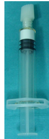
Figure 2. The “Defensive Antibacterial Coating ([DAC®] Novagenit Srl, Mezzolombardo, Italy) is a fast-resorbable hydrogel coating composed of covalently linked hyaluronan and poly-D,L-lactide. It is supplied in a prefilled syringe as a powder that is reconstituted at the time of surgery with a solution composed of sterile water for injection and antibiotic(s).

Reconstitution of the DAC® hydrogel was performed according to the manufacturer's instructions. Briefly, a prefilled syringe, containing 300 mg sterile DAC powder (Fig. 2), was filled at surgery with a solution of 5 mL sterile water for injection and the desired antibiotic to obtain in approximately 3 to 5 minutes the antibiotic-loaded hydrogel at a DAC concentration of 6% (w/v) and an antibiotic concentration ranging from 20 mg/mL to 50 mg/mL, depending on the surgeon's choice. The surgeons could choose the antibiotic from among a list of antibacterials previously tested as being compatible with the hydrogel (Novagenit SRL, data on file). A few minutes after reconstitution, the hydrogel was directly spread onto the implant, which was then inserted into the body in the usual way (Figs. 3 and 4).